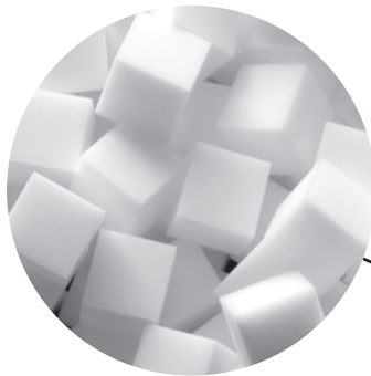
Open Cell Foam Media

Once sprayed, the effluent moves via gravity down through the media where natural microbiological processes occur that provide high level treatment. After passing through the full depth of media, the effluent travels to the bottom of the mod and the flow is split with 80% back into the treatment stream and 20% to the final dispersal point. The final treated effluent meets the requirements of NSF/ANSI Standard 40, Class 1. NSF/ANSI Standard 40, Class 1.