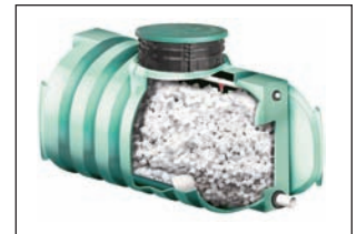
NS Series Mod Option