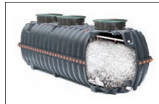
IM Series Mod Option