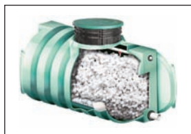
NS Series Mod Option