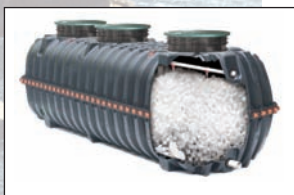
IM Series Mod Option